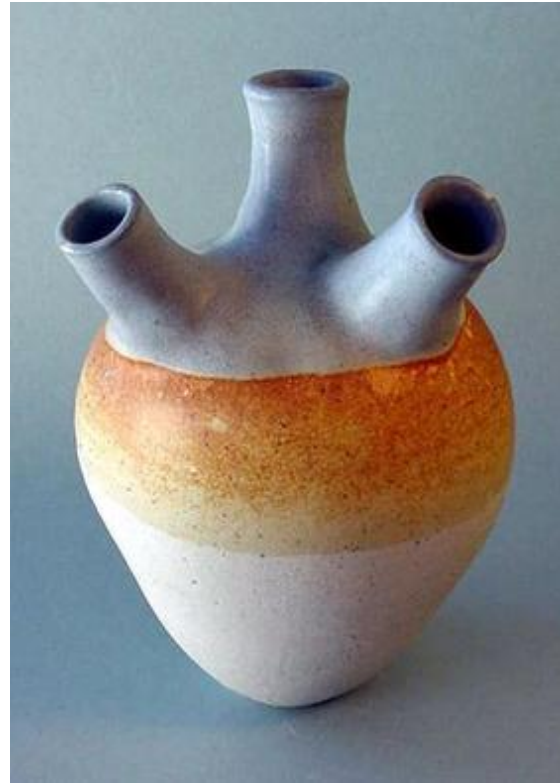
Skip Bleecker: "Blue Tan 3 Spout" - Sculpture Ceramic, 2003